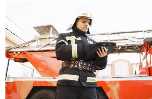
Anti-glare technology for sunlight readability

Furthermore, it supports various touch screen modes, including fingertips, stylus, or gloves. Its configurable multi-touch gestures give you quick access to commonly used Windows features and functions.