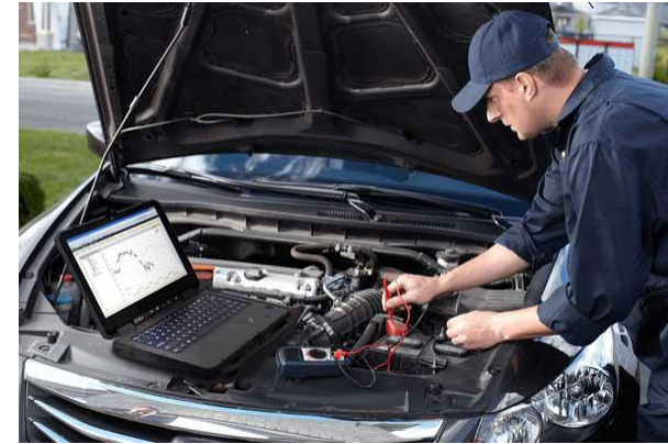
Onsite engineer is using Winmate's rugged laptop