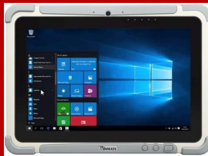
Winmate M101P-ME Healthcare Rugged Tablet