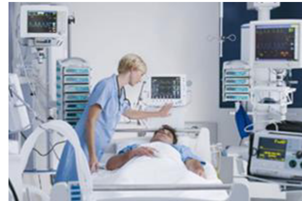
Patient monitoring and data collection