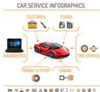
Application: Vehicle Diagnostics