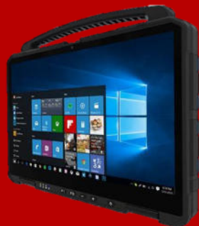
Winmate L140TG Rugged Laptop