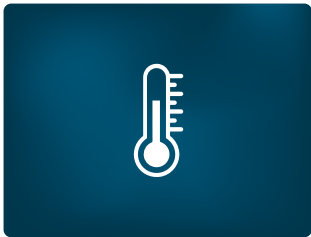
Standard & Wide Temperature