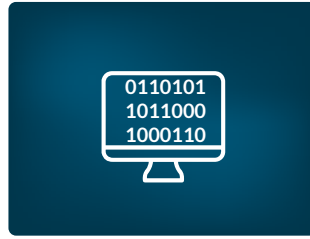
High Diskful Writes Per Day (DWPD)