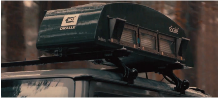
Dralle's High-precision timber stack measuring system - sScale.