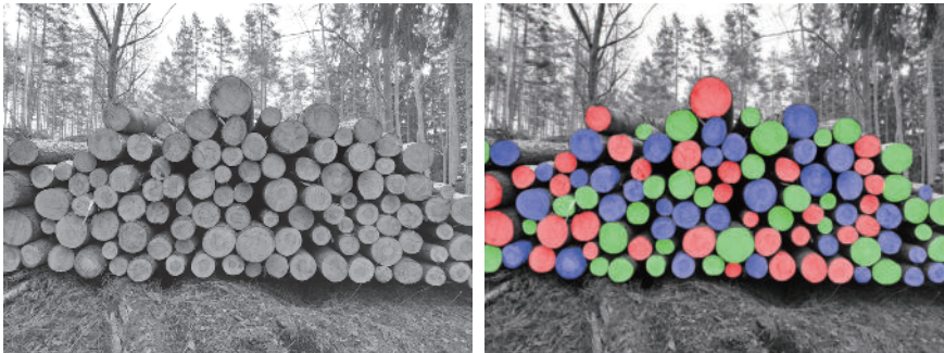
Dralle's high-precision 3D technology enables all-weather, all-season, day and night, off-grid timber measurement.