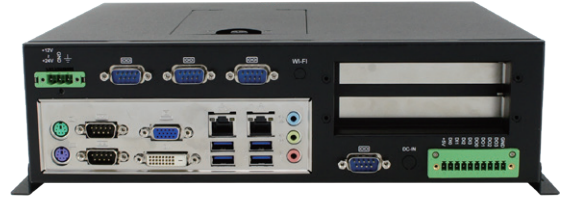
Based on MI808 I/O