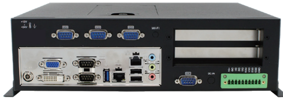
Based on MI805 I/O