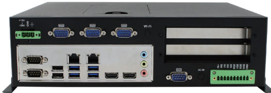
Based on MI811 I/O