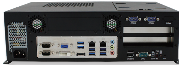
Based on MI982 & MI981 I/O