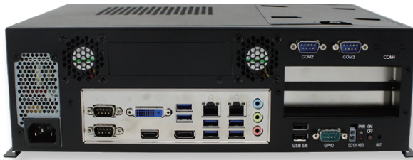
Based on MI991 & MI990 I/O