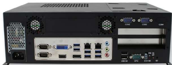
Rear I/O (Based on MI992VF-X3G & MI991 & MI990 I/O)