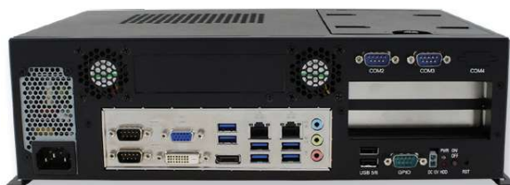
Rear I/O (Based on MI982 & MI981 I/O)