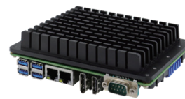
IB822 with Heatsink