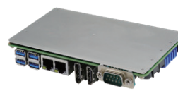
IB822 with Heat spreader