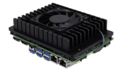
IB956 with Heatsink