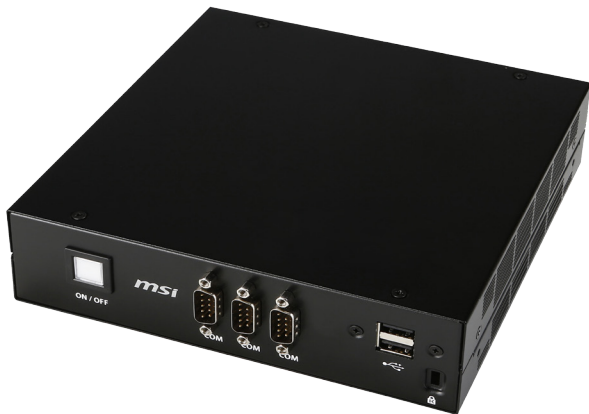
MS-9A78 with Haswell