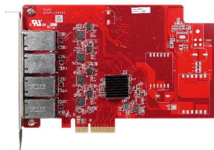
Figure 2: PCIe Board Picture