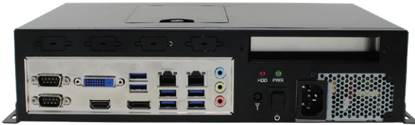
Based on MI991 & MI990 I/O