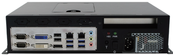
Based on MI985 & MI980 I/O