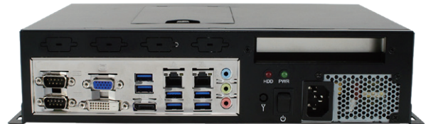
Based on MI982 & MI981 I/O